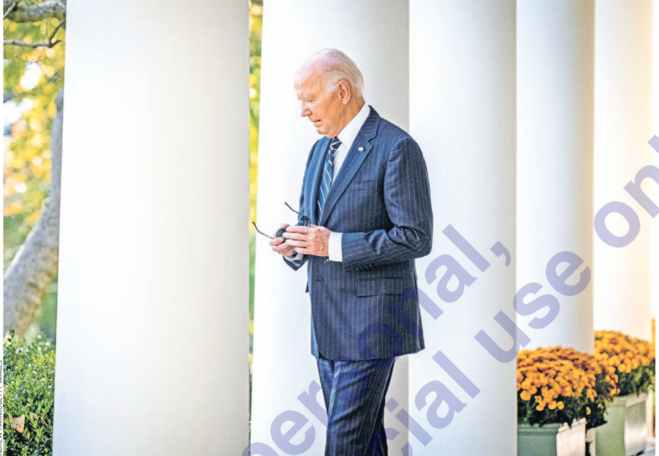
CLOSING: President Biden, stepping out of the Oval Office to speak about the election Thursday, pledged to peacefully transfer power to Donald Trump after a divisive vote that saw his endorsed successor, Vice President Kamala Harris, lose decisively. A7

EV startup Rivian said a parts shortage in the third quarter hampered factory production, but it was still on track to report its first gross profit by year's end. B1 Nissan said it would cut 9,000 jobs and reduce its global production capacity by one-fifth as its sales fall. B1