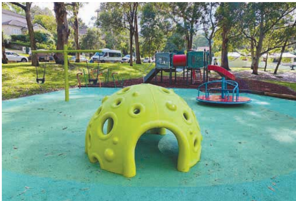
Four playgrounds are earmarked for an upgrade in 2022/23. Pictured above is a recently upgraded playground at Stringybark Reserve.

For more details on what's planned www.lanecove.nsw.gov.au/liveablelanecove